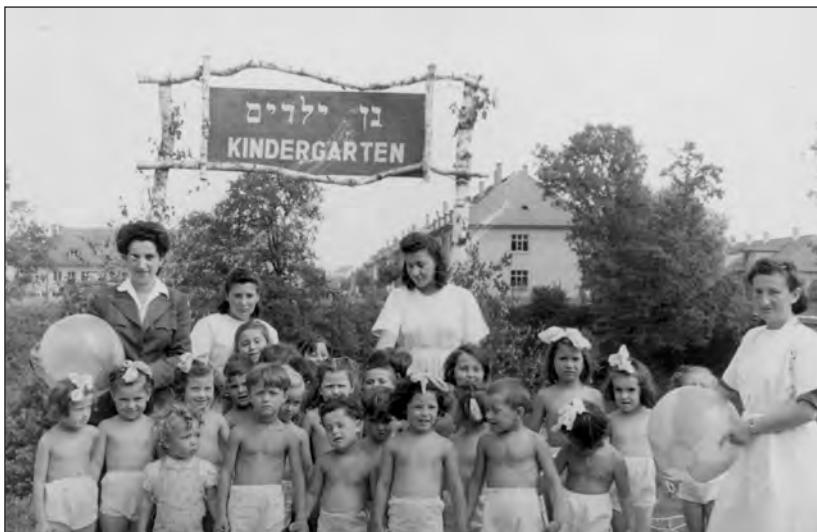
Over 2,000 children of Holocaust survivors were born in the Bergen-Belsen Displaced Persons Camp; Kindergarten class, late 1940s

The largest Jewish refugee camp in post-war Germany, this vibrant self-governed community's political, cultural, religious, educational, and social activities renewed the survivors' return to life and played a pivotal role in the struggle for the creation of the State of Israel. Through archival film, photographs, and documents, learn how the survivors' resilience and optimism offer us stories of hope and healing for our day.